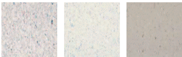
AL-10 AL-19 WHITE/COASTAL AL-34 GREIGE/TAUPE