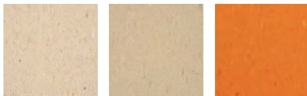
AL-41 MULTI/TOAST AL-47 GOLDEN WHEAT AL-60 ORANGE GLOW

*Also available in TT Series in 3/32" gauge