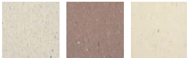
AL-37 PUTTY/CLAY/SIENNA AL-44 COFFEE/WALNUT AL-56 SOFT SHELL