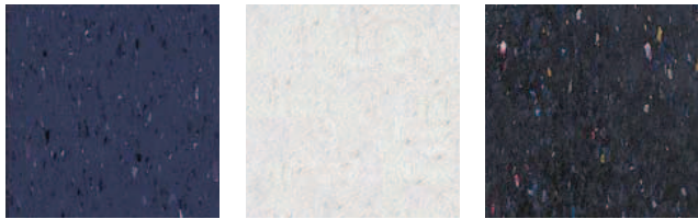
AL-00 DEEP PURPLE AL-11 PEARL WHITE TT-11* AL-25 CONFETTI BLACK

Dark colored patterns are subject to scratch whitening. If used in field areas, more frequent maintenance may be required.