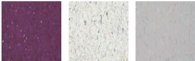
AL-01 PLUM AL-13 HEATHERED STONE BLUE/COFFEE AL-31 PEWTER SHADOW