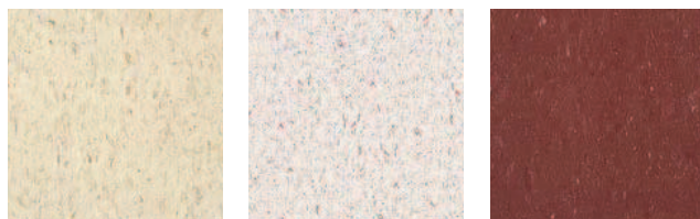
AL-43 MUSHROOM TT-43* AL-49 HEATHERED BLUE/MOCHA AL-64 SANTA FE CLAY