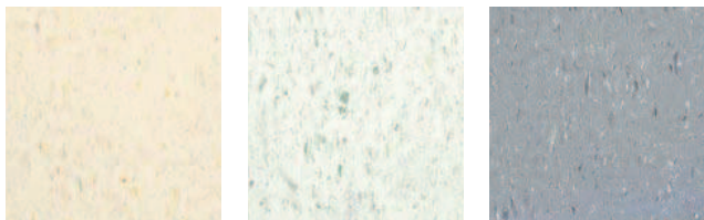
AL-06 MULTI/DESERT AL-18 EMERALD LACE AL-33 IRON GRAY TT-33*