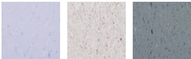
AL-02 LILAC AL-15 HEATHERED ROSE AL-32 MEDIUM STONE GRAY